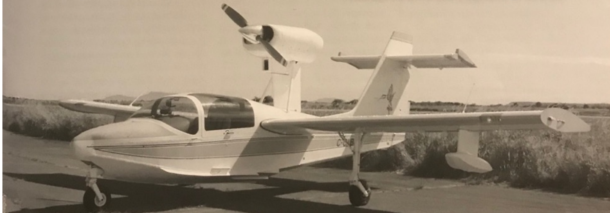
Above: Beat Meyer's incomparable Seafire.