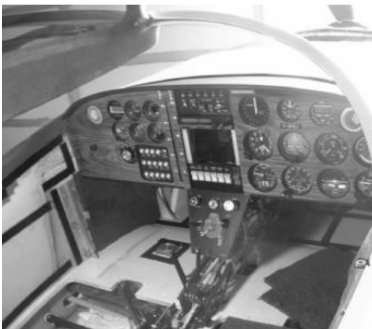
A look inside the cockpit shows a full instrument panel.