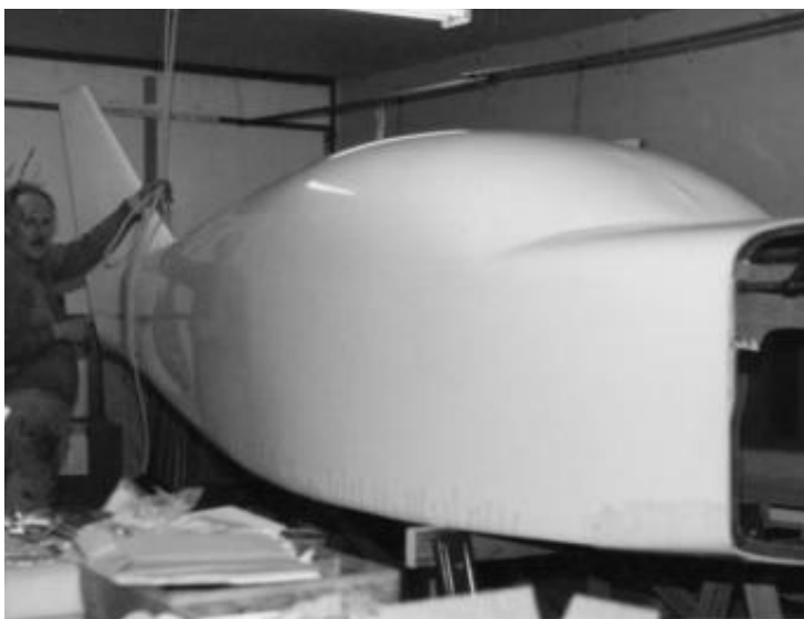
This is what you get to start with.