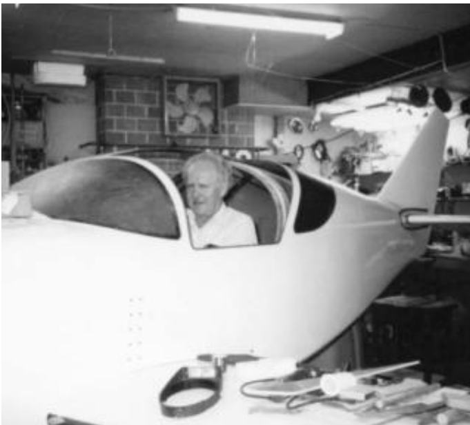
What bulider hasn't sat in his/her unfinished project "just to see if it fits".