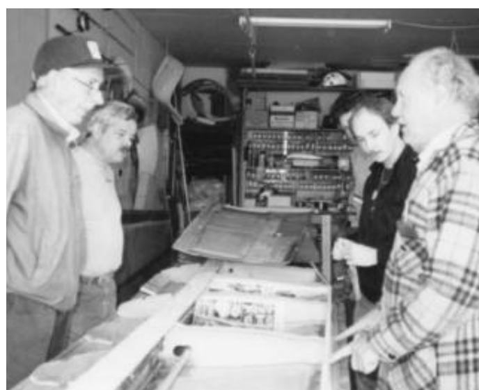
Just before the top skin is glued onto the wing some preplanning is necessary!