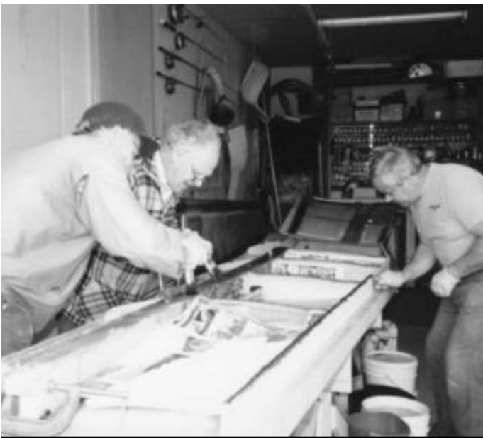
With a window of 20 -30 minutes it was important that evryone knew their job.