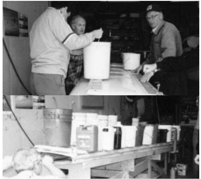
And then the weight. Lots of weight.