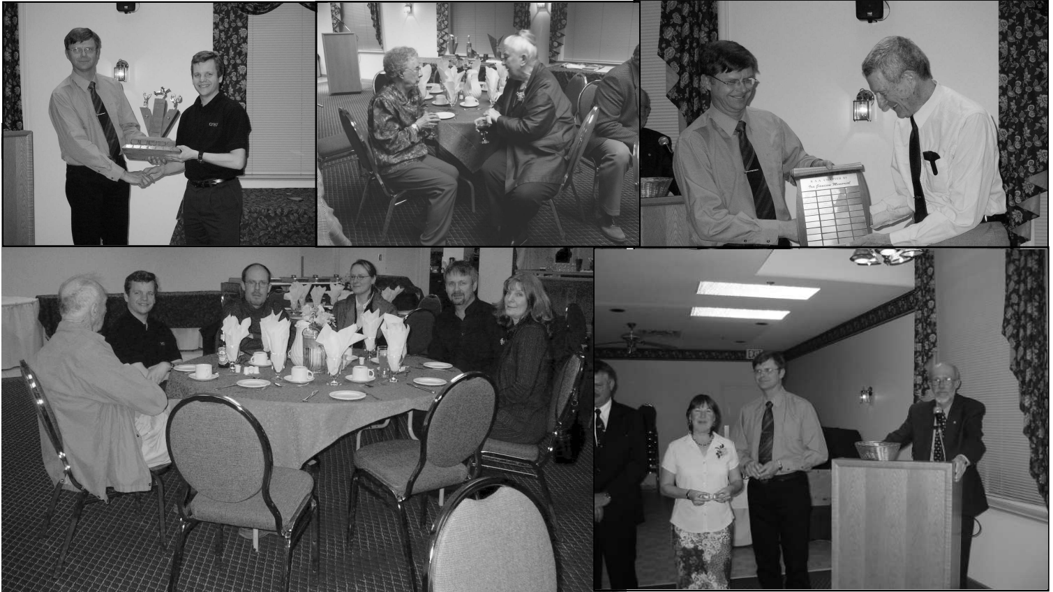
Reflections from Our Annual Awards Banquet